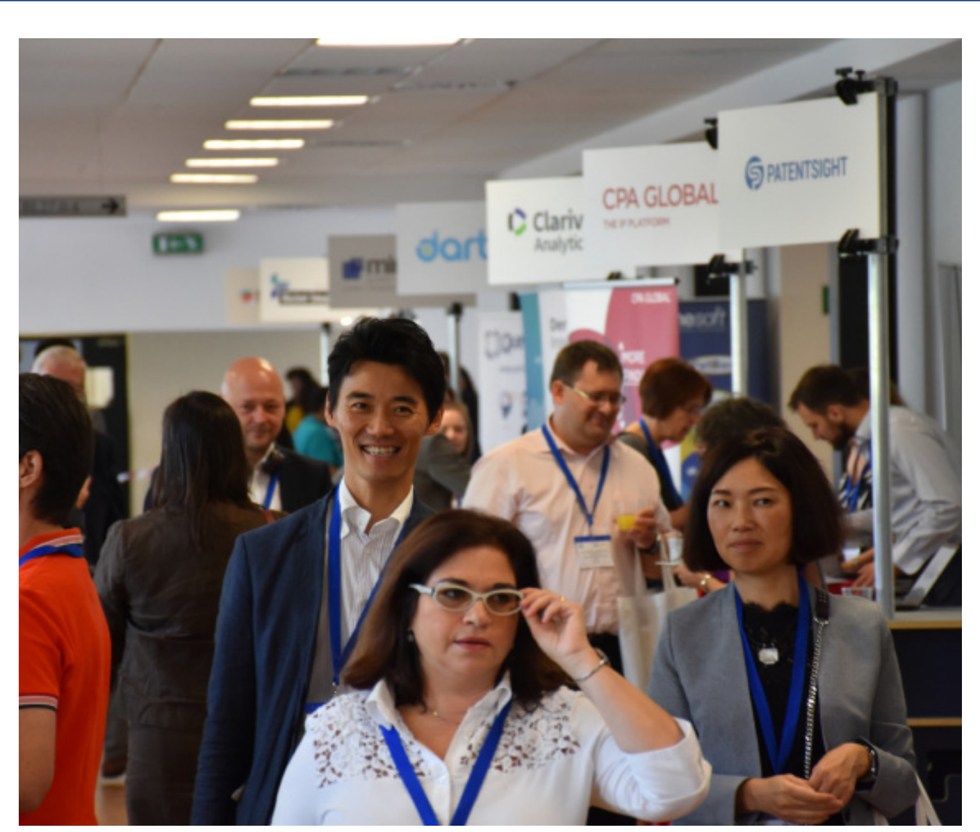
Photo from the CEPIUG 15th Year Anniversary Conference Exhibiton - 2023