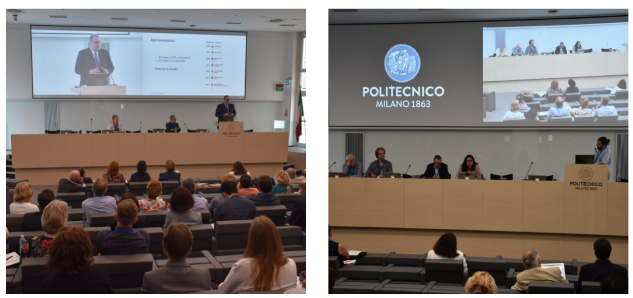
CEPIUG Chair Speeches from 2023

In case of cancellation of the event, the Organization will refund only the fees paid at the date in which the cancellation will be notified on the website of the CEPIUG (www.cepiug.org).